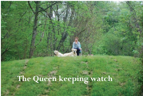
The Queen keeping watch