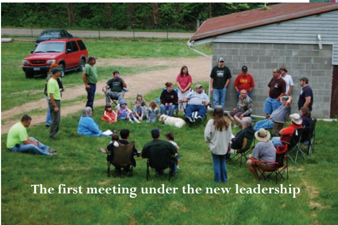
The first meeting under the new leadership